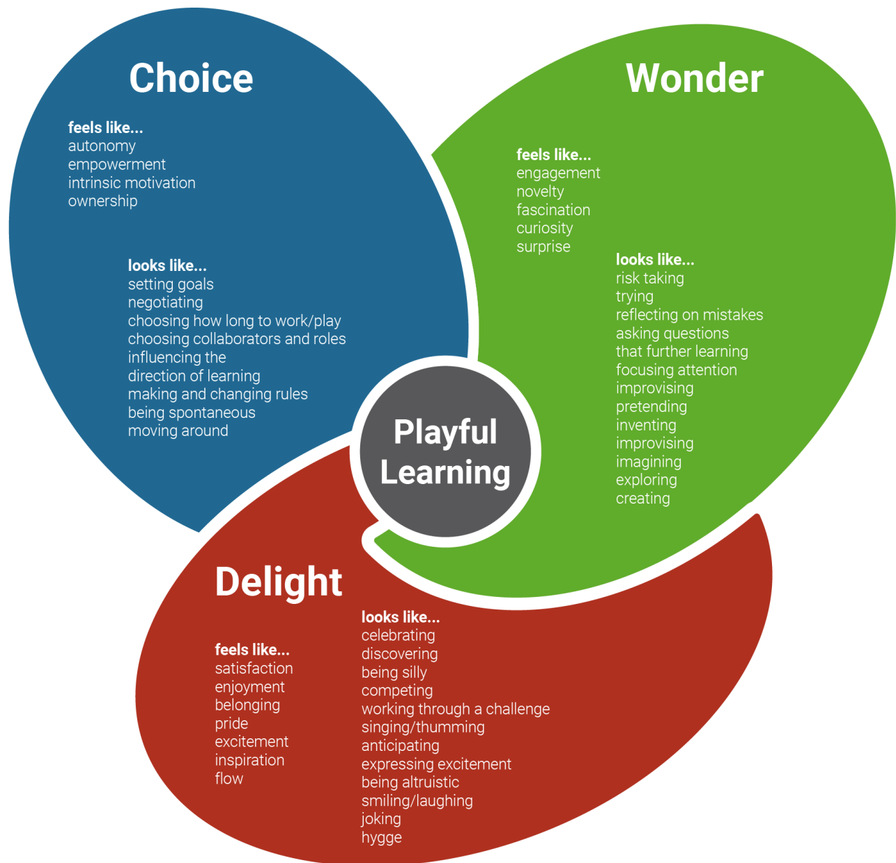
Figure 2: International School of Billund Indicators of Playful Learning