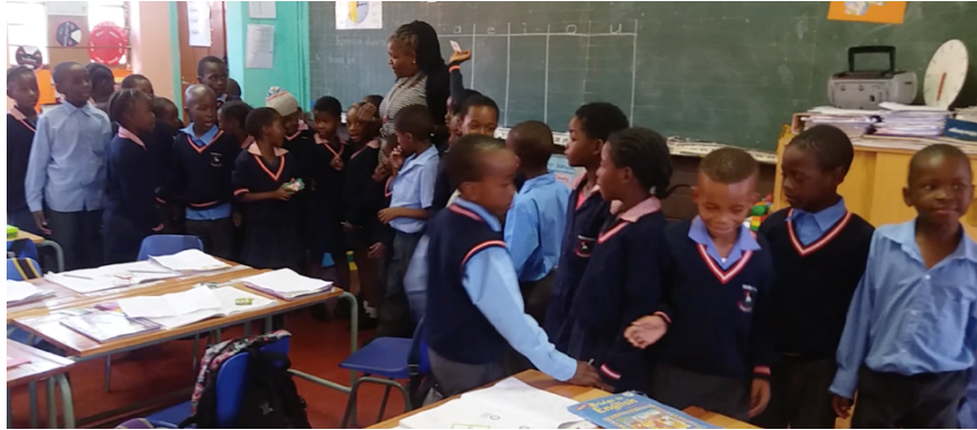
Acting out the word come

For club , groups of children imagine and enact being part of a soccer, dance, and book club.