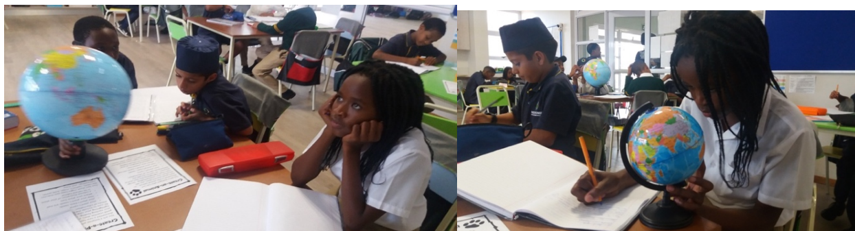
Thinking and then starting to write

I don't want it to come from South Africa. I want to go somewhere where nobody has ever been to. Or somewhere that is very rare. Something new, like having an ice cream flavor for the first time...I just want to find something that is really exciting...It will stand out. It will be a little different. It will have that little touch.