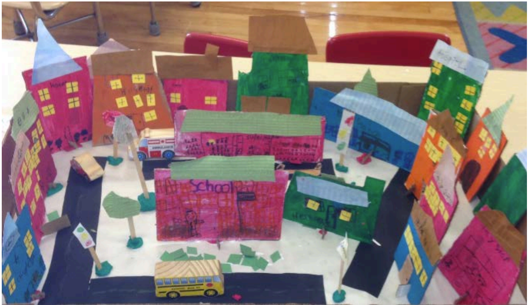
Awilda Molina's students at the Sumner envisioned what the neighborhood around their school might look like.