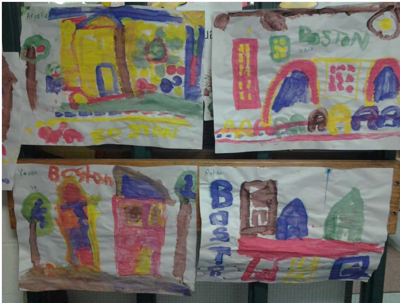
Regina Nunez's students in Room 102 at the Harvard Kent ideas for Boston include: kids toy cars in Boston that children can drive to school by themselves, a new park for kids with more flowers and more trees, a lot of new Boston toy shops for children and bouncing houses in the parks for Boston children.